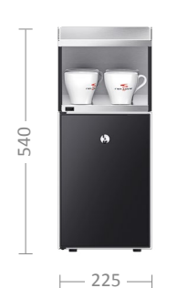
4l Cooler S1 | S2 | X-series L4v with cup warmer 21 kg | 0.12 kW 1)