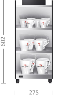
Cup Warmer S300 | S500 W 12 kg | 0.2 kW 1)