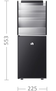
4l Cooler S300 | S500 L4s with dispenser 18 kg | 0.04 kW 1)