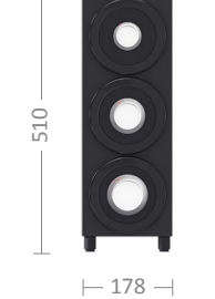
Cup Dispenser all CD 13 kg