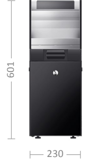
9l Cooler S300 | S500 L9s with dispenser 21 kg | 0.04 kW 1)