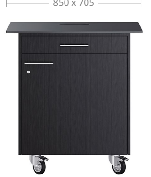
Mobile Cart all Water Self Supply | Pump | Filter 54 kg