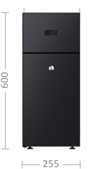
15l Cooler all L15 | L15 UBR under-counter 23 kg | 0.08 kW 1)