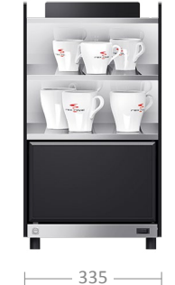
4l Cooler S300 | S500 Fh4 with cup warmer 25 kg | 0.3 kW 1)