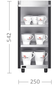
Cup Warmer S1 | S2 | X-series W 17 kg | 0.16 kW 1)