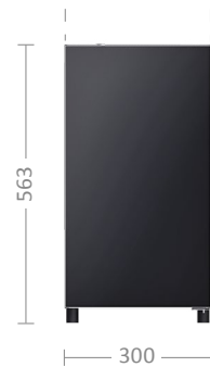
10l Cooler all R10 UBR under-counter 30 kg | 0.09 kW 1)