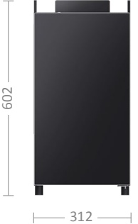
10l Cooler S300 | S500 R10 30 kg | 0.09 kW 1)