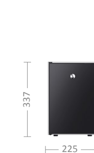
4l Cooler all L4 14 kg | 0.04 kW 1)