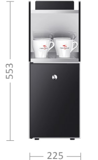
4l Cooler S300 | S500 L4v with cup warmer 21 kg | 0.12 kW 1)