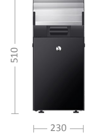
9l Cooler S1 | S2 | X-series L9s with dispenser 20 kg | 0.04 kW 1)