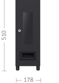
Aroma Module S1 | S2 | X-series A 16 kg