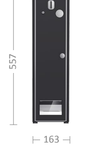
Coin Changer all Mynt casing | Mynt CC with coin changer 21 kg | 23 kg