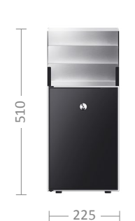
4l Cooler S1 | S2 | X-series L4s with dispenser 18 kg | 0.04 kW 1)