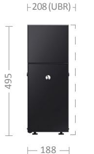
7l Cooler all L7 | L7 UBR under-counter 17 kg | 0.04 kW 1)